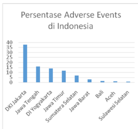
Picture 1. Patient safety incidence report in 2007 based on province.